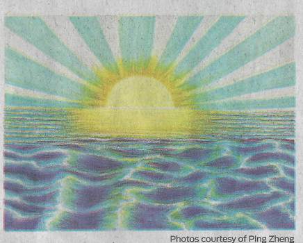
Works included in "The Voice of Water" exhibition by artist Ping Zheng include, clockwise from top left, "The Heat of the Day," "Maze," "Infinity" and "Strange Time, A Strange Dream."

with tall and rippling land masses towering over a suggestive V-shaped body of water. "A Long Stream