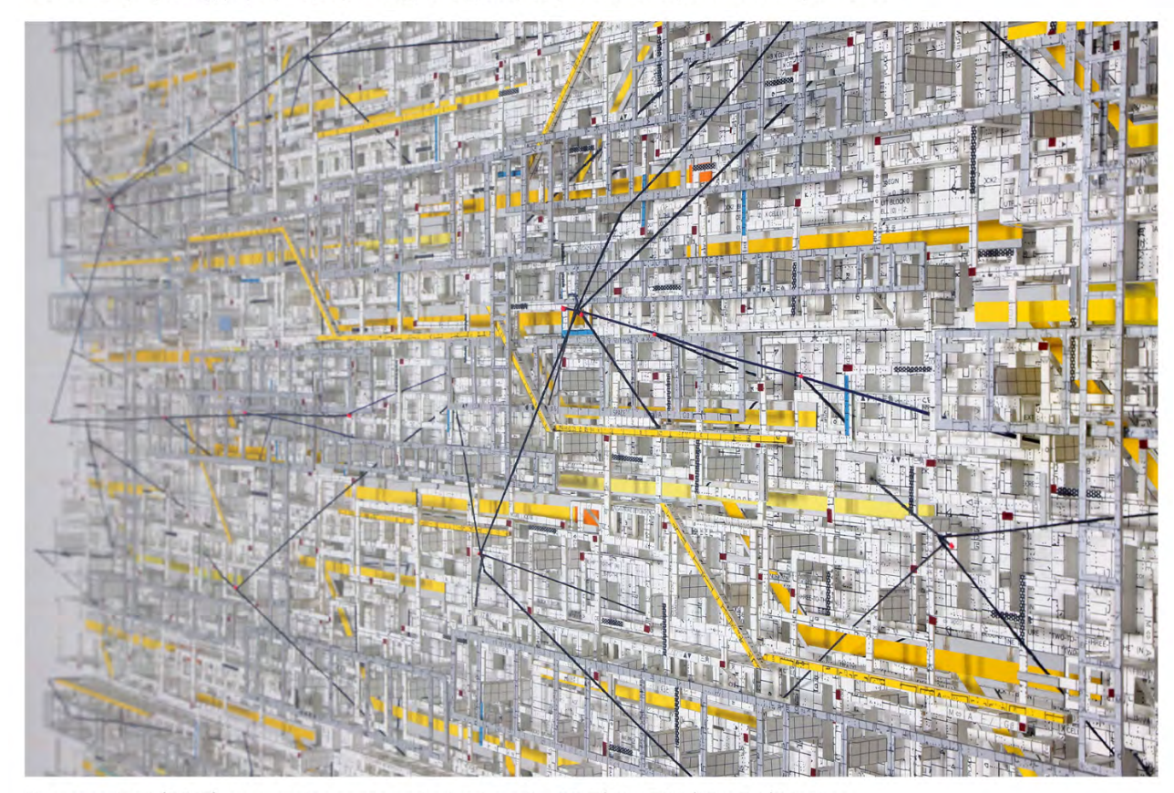
"Intersection" (2017), watercolor paper and mixed media, 29 \frac{7}{16} \times 59 \frac{1}{16} \times 51/2 inches