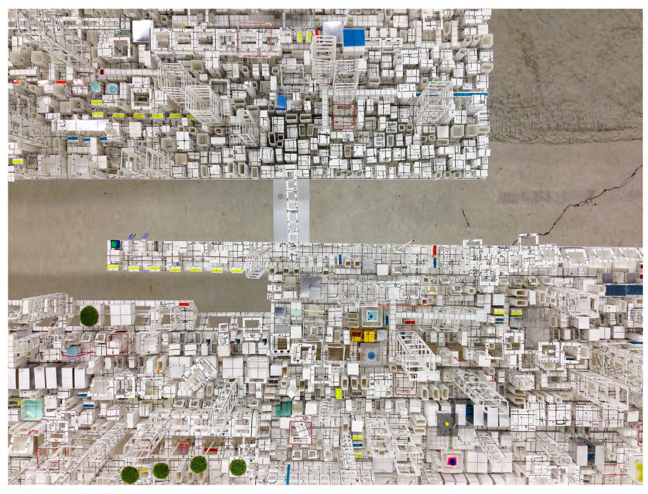
"Bonsai City" (2014), paper, inkjet printing, fake grass, acrylic elements, 8 x 118 x 21 1/2 inches