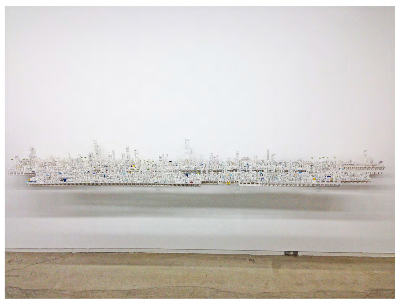
"Bonsai City" (2014), paper, inkjet printing, fake grass, acrylic elements, 8 \times 118 \times 211/2 inches