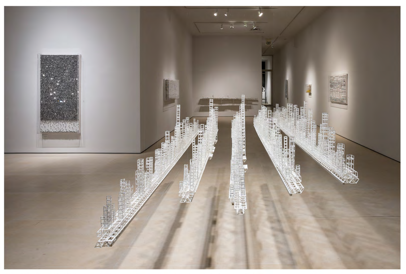
"Fata Morgana" (2014), paper, inkjet printing, glitter, 25 1/2 \times 119 \times 1/2 \times 51 \times 1/2 inches