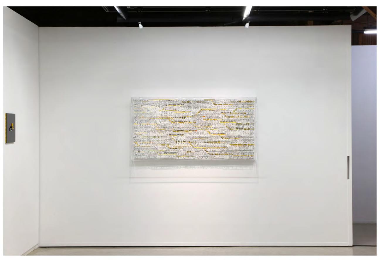
"Intersection" (2017), watercolor paper and mixed media, 29 \frac{7}{16} \times 59 \frac{1}{16} \times 51/2 inches