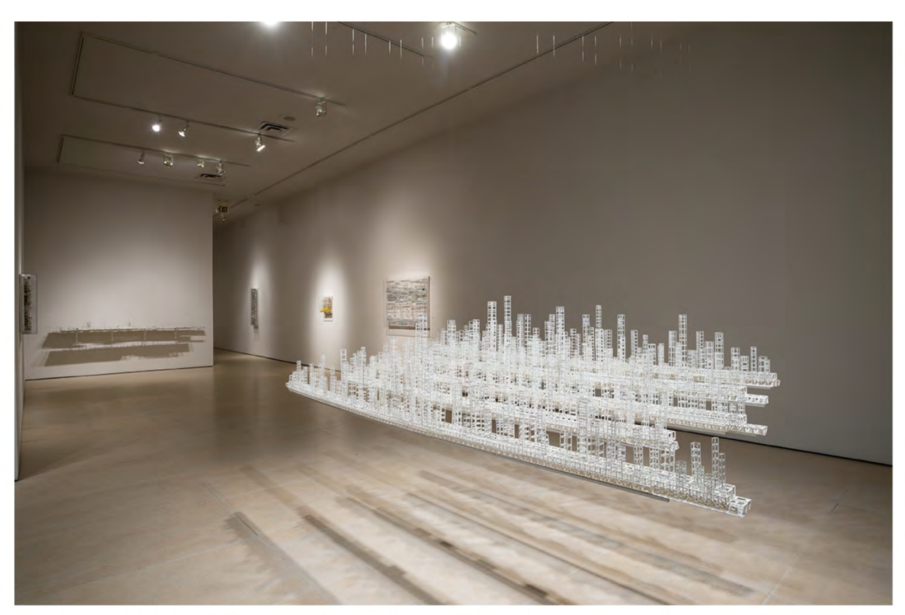
"Fata Morgana" (2014), paper, inkjet printing, glitter, 25 1/2 \times 119 \times 1/2 \times 51 \times 1/2 inches