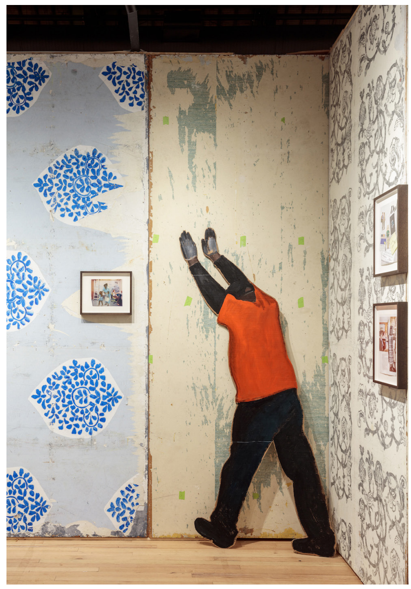
Installation view of Ramiro Gomez Installer 4(2020) at P.P.O.W. at the ADAA Art Show.