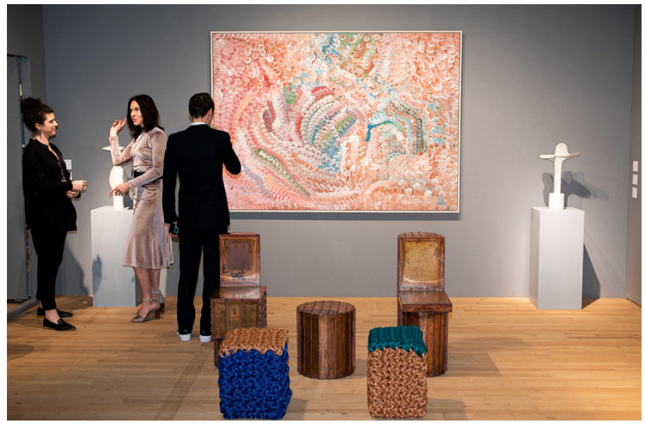
Visitors browse the gala preview of the ADAA Art Show's 2020 edition.

We perused the booths to highlight the most impressive stands in the fair. Artnet News, February 27, 2020