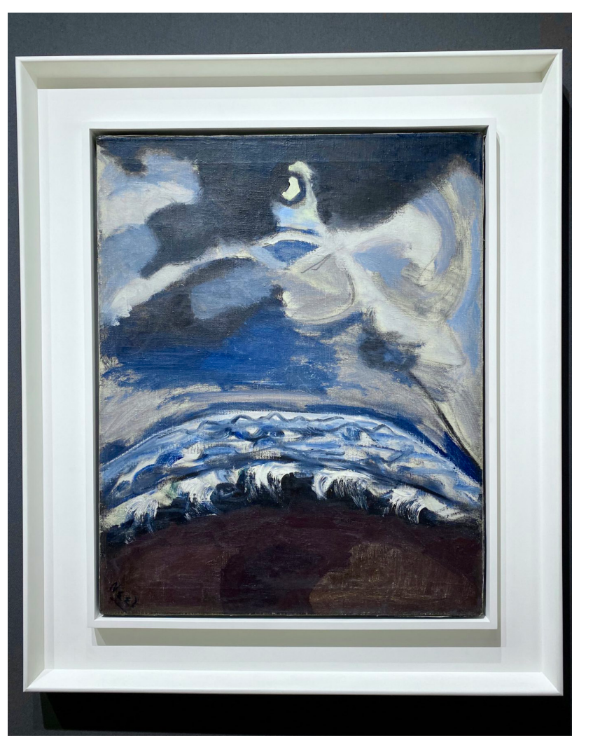
The Sea (1947) Alice Neel