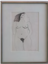
Fritz Scholder Nude , 1975 Ink on Paper Paper size: 11 x 8 inches (27.9 x 20.3 cm) Frame size: 16 3/4 x 13 1/4 inches (42.5 x 33.7 cm)