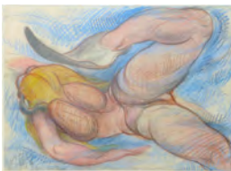
Luis Jimenez Scuba , 1968 Colored pencil on paper 22.5 x 16 inches (57.2 x 40.6 cm)