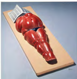
Luis Jimenez Sunbather , 1969 Polychrome fiberglass 11 x 60 x 22 inches (27.9 x 152.4 x 55.9 cm) Edition 1/5