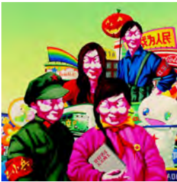
Zhao Bo The Sincere Era , 2006 Oil on canvas 78.74 x 78.74 inches 200 x 200 cm