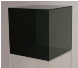
Larry Bell Cube #47 (Black/Grey) Colored glass coated with inconel 15 x 15 x 15 inches