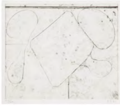
Richard Diebenkorn Card Game , 1981 Mono-toned etching 11" x 12 7/8" with margins Edition 19/35 Numbered lower left hand corner in the margin