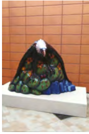
Luis Jimenez Eagle , 2003 Polychrome fiberglass 56 x 52 x 29 inches