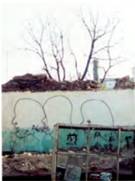
Zhang Dali Dialogue , 1996 113A, 1996 C-print 59.06 x 39.37 inches