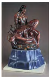
Luis Jimenez Southwest Pieta Maquette , 1983 Polychrome fiberglass with urethane finish 22 x 14 x 12 inches (55.9 x 35.6 x 30.5 cm)