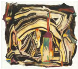
Terence La Noue Samoset's Pool I , 1998 Mixed media on paper 22 1/4 x 25 in.