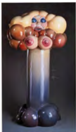
Luis Jimenez Bomb , 1968 Polychrome fiberglass 77 x 41 x 29 inches (195.6 x 104.1 x 73.7 cm) Edition 1/5