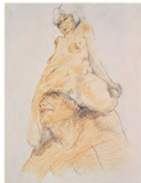
Luis Jimenez Oedipal Dream , 1968 Colored pencil and graphite on paper 23 5/8 x 17 3/8 inches (60 x 44.1 cm)