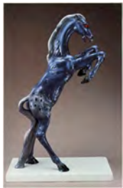
Luis Jimenez Mustang model , 1993 Polychrome fiberglass Horse: 30 x 17.5 x 8 inches (76.2 x 44.5 x 20.3 cm) Base: 10 x 20 x 1.5 inches (25.4 x 50.8 x 3.8 cm)