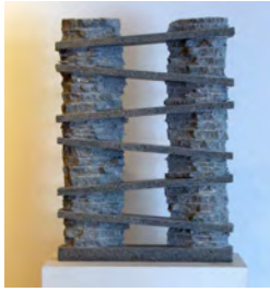
Jesús Morales Lapstrake Maquette , 1987 carved and polished granite 34 x 25 x 4.25"