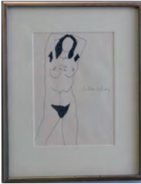
Fritz Scholder Nude , 1975 Ink on Paper Paper size: 11 x 8 inches (27.9 x 20.3 cm) Frame size: 16 3/4 x 13 1/4 inches (42.5 x 33.7 cm)