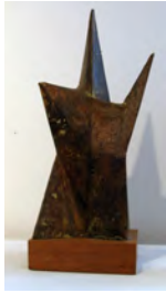
Lynn Chadwick Split IV , 1965 Cast bronze with brown patina 16.75" height Edition 1/4 numbered on lower left hand corner of the piece