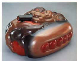
Luis Jimenez Tank - Spirit of Chicago , 1968 Polychrome fiberglass 19 x 34 x 30 inches (48.3 x 86.4 x 76.2 cm)