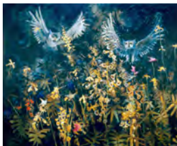
John Alexander White Owls in the Pursuit of Something Special , 1994 Oil on canvas 58.5 x 70 inches 148.6 x 177.8 cm