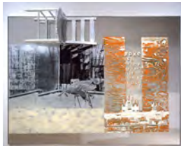
Robert Rauschenberg Pegasits/ROCI USA (Wax Fire Works) , 1990 Acrylic, fire wax, and chair on stainless steel 72 3/4 x 96 3/4 x 17 1/2 in. Edition 17/22