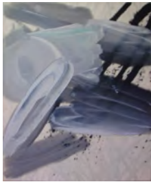
Ed Moses Evod (Branco) , 2006 Acrylic on canvas 60 x 48