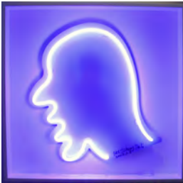
Zhang Dali Dialogue , 2007 (?) Neon 24 x 24 x 6 inches