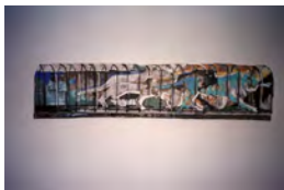
Andres de Nagel Metaphysical Box XXXVII , 1989 Mixed Media and oil on polyester and fiberglass 11" x 47 5/8" x 2 3/8"