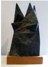
Lynn Chadwick Polygon IV , 1964 Cast bronze with black patina 16.5" height Edition 1/4 numbered on lower back of the piece