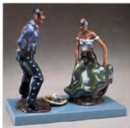
Luis Jimenez Fiesta Dancers Model , 1985 Polychrome fiberglass with urethane finish 17 x 19.5 x 11 inches (43.2 x 49.5 x 27.9 cm)