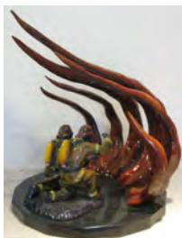
Luis Jimenez Firefighter , 2004 Polychrome fiberglass 24 x 21 x 21 inches (61 x 53.3 x 53.3 cm) Edition 1/7