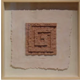
Jesús Moroles Greek Key Paper bas relief 25 x 25 x 3 (framed) Edition 9/10