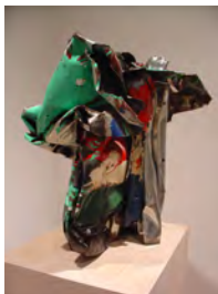
John Chamberlain Untitled , 1985 Chromed, painted and stainless steel 28 x 24 x 21 inches 71.1 x 61 x 53.3 cm