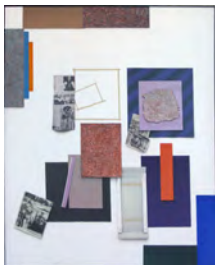
Paul Sarkisian No. 1 , 1981 Oil and collage on canvas 89 1/4" x 74 1/8"