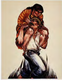
Luis Jimenez Cruzando el Rio Bravo - Border Crossing , 1987 Color lithograph 31 x 23 inches (78.7 x 58.4 cm) Edition 76/90