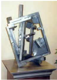
Joel Perlman Square Cluster , 1983 Polished steel 27 x 20 x 15 inches Unique