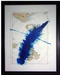
Julian Schnabel Southern Entrances to Sumner Strait , 2006 Mixed media on map 65 x 52 in.