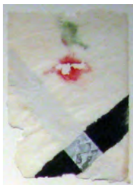
Richard Tuttle Untitled watercolor on paper 8.5 x 11 inches