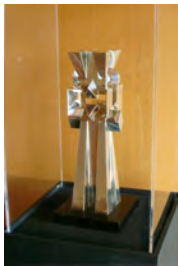
Sebastián (Enrique Carbajal) Old God , 2007 Silver 16.9 x 7.7 x 7.7 inches (42.9 x 19.6 x 19.6 cm) Edition 2/5